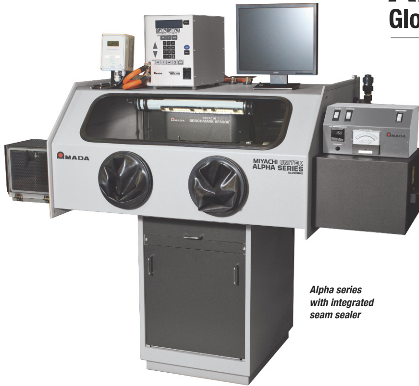
Alpha series with integrated seam sealer

The field proven Alpha Series glovebox systems provide compact and effective platforms for environmental control with excellent price to performance value. The Alpha Series is excellent for both production R&D applications. The glovebox is available in two sizes: one for projection welding applications and the other for seam sealing or general industrial use. Straight-forward controls allow the operator to easily operate oven, vacuum and inert gas backfill controls.