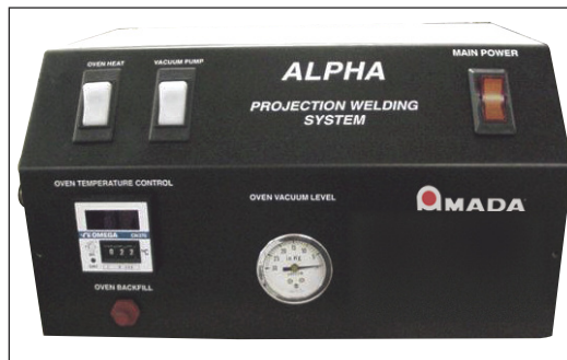
Vacuum oven controller unit