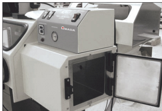
Alpha series optional vacuum bakeout oven